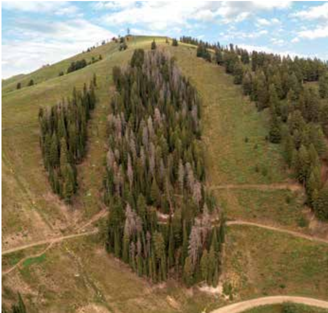
Bald Mountain before thinning