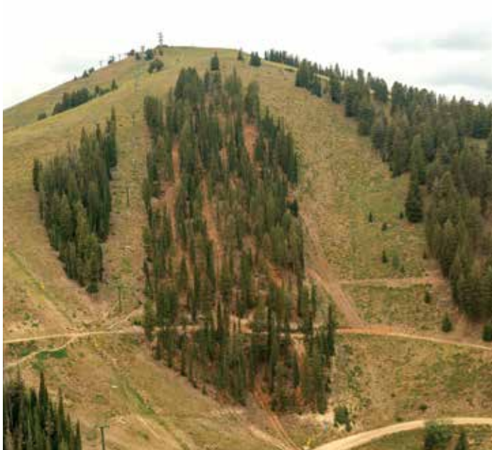
Bald Mountain after thinning