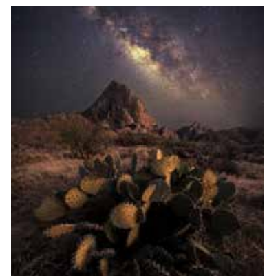
Above: Lolo National Forest. Above right: Monongahela National Forest. Bottom right: Coronado National Forest.